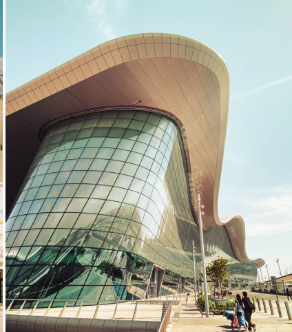
📍 5 Airports, Abu Dhabi