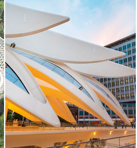
📍 UAE Pavilion, Expo 2020