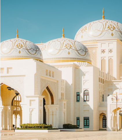
📍 Qasr Al Watan, Abu Dhabi