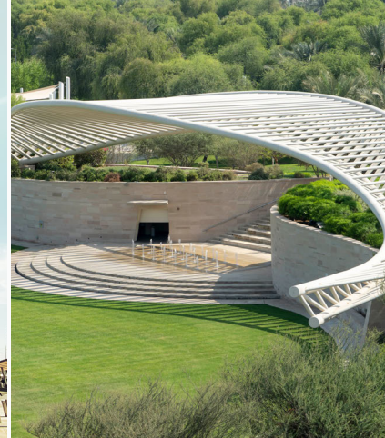
📍 Umm Al Emarat Park, Abu Dhabi