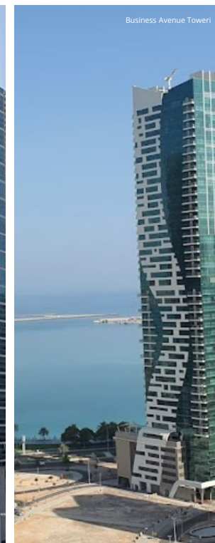
Business Avenue Tower